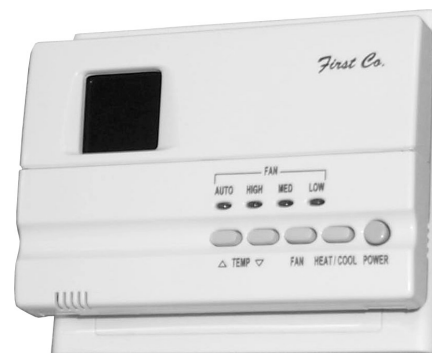
(Shown with wall plate)

For ceiling fan coils (AHBC/APHBC/ACHBC/ARHBC, and AHYB/APHYB series), a "Controller Enclosure" is factory installed, which includes the control board, transformer, and disconnect switch. For AMB/AMB-HW and ACW/ACW-HW/ACWE series upflow or horizontal fan coils, the optional control board and transformer can be factory installed inside the unit wiring compartment. A disconnect switch is not available with the AMB/AMB-HW and ACW/ACW-HW/ACWE models.